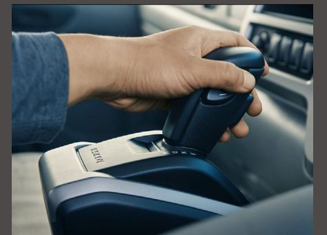
New Quester with the new ESCOT transmission and its optimized driveline can save up to 10% fuel.